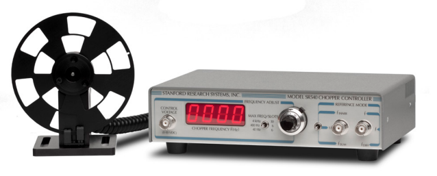
SR540 Optical Chopper

Synchronous filtering may also be selected at reference frequencies below 4 kHz. The synchronous filter notches out multiples of the reference frequency and is extremely useful in making low frequency measurement where multiples of the reference frequency would otherwise show up in the lock-in output. Unlike previous designs the synchronous filter in the SR865A can be selected with no loss of output resolution.